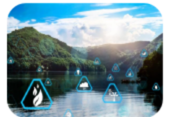
Water Resources and Environmental Protection