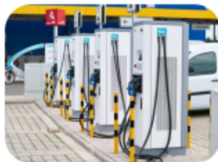
Charging/battery swap stations