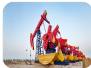
Oil Wells and Mines